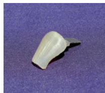
11273-030 Toe nail A (20 pcs set)