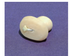
11273-060 Corn (10 pcs set)