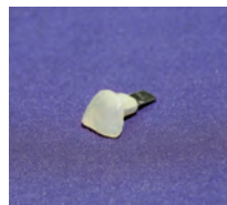
11273-040 Toe nail B (20 pcs set)