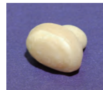
11273-050 Callosity (10 pcs set)